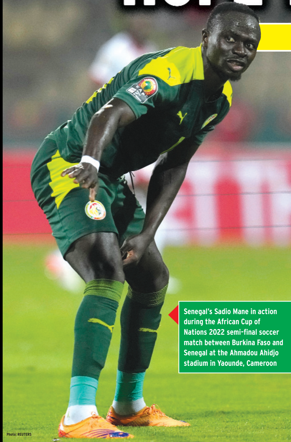
Senegal's Sadio Mane in action during the African Cup of Nations 2022 semi-final soccer match between Burkina Faso and Senegal at the Ahmadou Ahidjo stadium in Yaounde, Cameroon

Mané caps 3-1 win to send Senegal into African Cup final