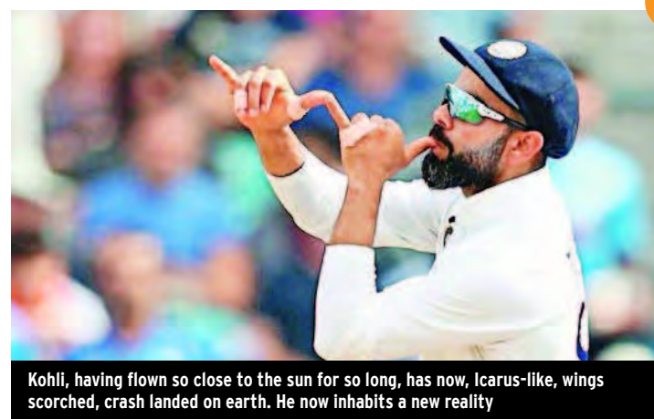
Kohli, having flown so close to the sun for so long, has now, Icarus-like, wings scorched, crash landed on earth. He now inhabits a new reality

dia's downfall in the series. Not that India needed any help in that regard in this particular series. Kohli, having flown so close to the sun for so long, has now, Icarus-like, wings scorched, crash landed on earth. He now inhabits a new reality. For years, he was the sole, unquestioned power centre of Indian cricket. No one dared touch him. Now, the cloak of invincibility has slipped. Kohli could brush aside administrators, the coach, the board, and players. Now, he is simply a player. Perhaps India's biggest star player, but still merely a player. It will take quite some getting used to. For his sake, and for the sake of Indian cricket, one hopes that the floodgate of runs opens again.