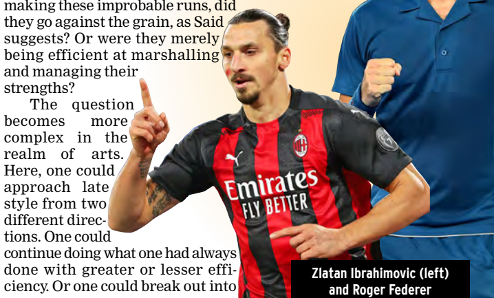
Zlatan Ibrahimovic (left) and Roger Federer