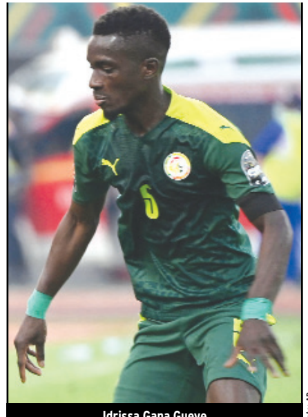
Idrissa Gana Gueye