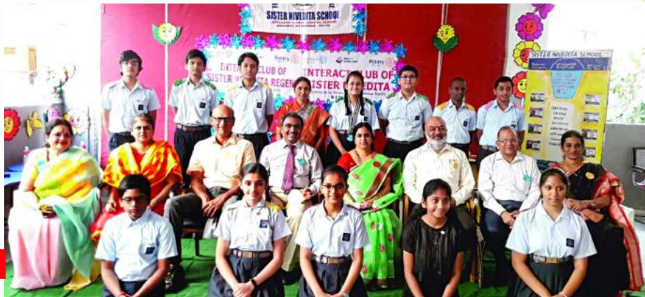
Sister Nivedita School Hyderabad