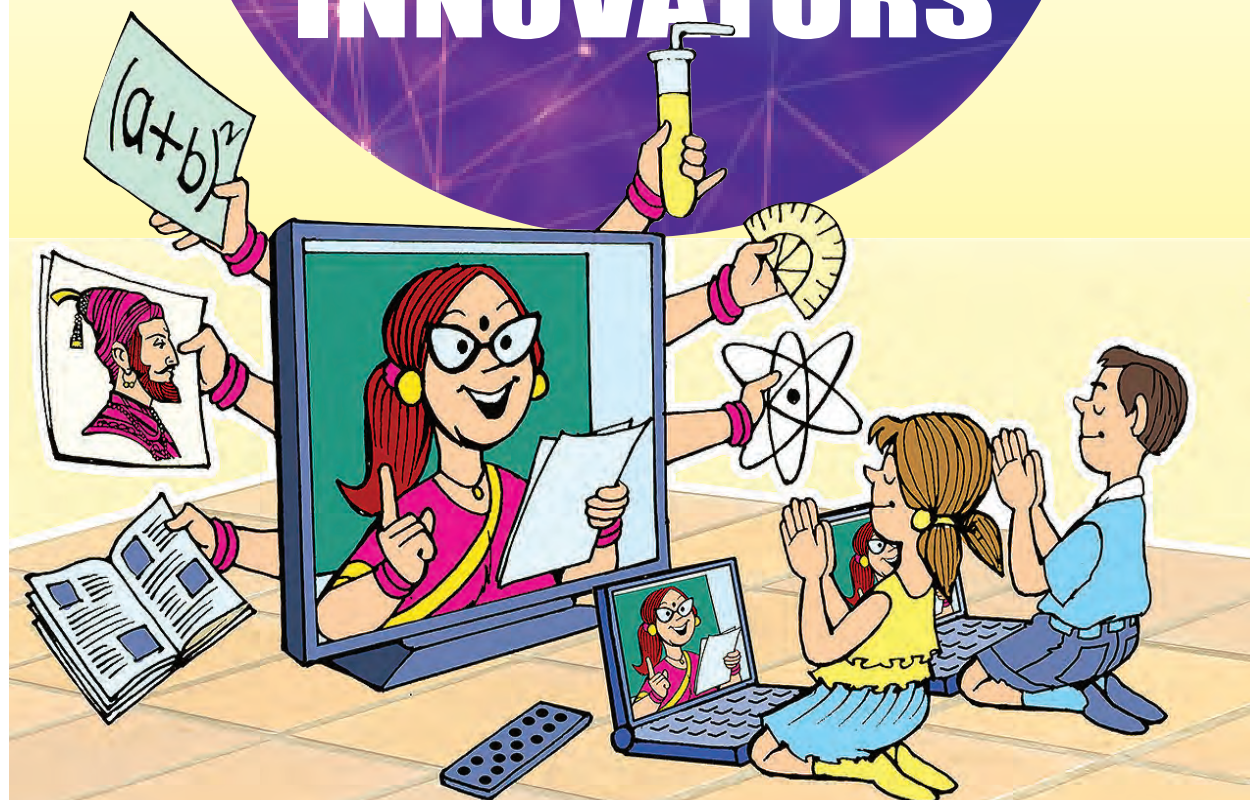
Illustration: Ajit Ninan