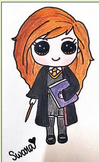
Swara Sathe, class VII, Gitanjali Devashray, Hyderabad