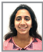
B SUDI KSHA